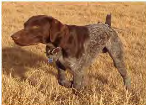
Great Oaks Wild One (Beau)