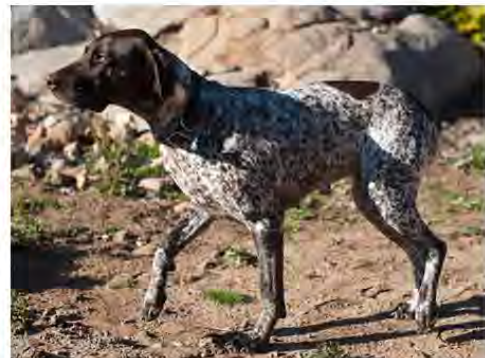
Jamul's Greta of Champagne