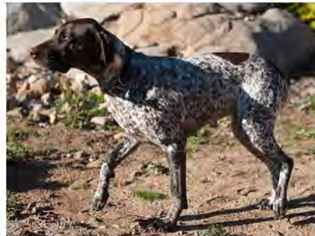
Jamul's Greta of Champagne