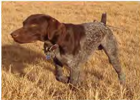
Great Oaks Wild One (Beau)