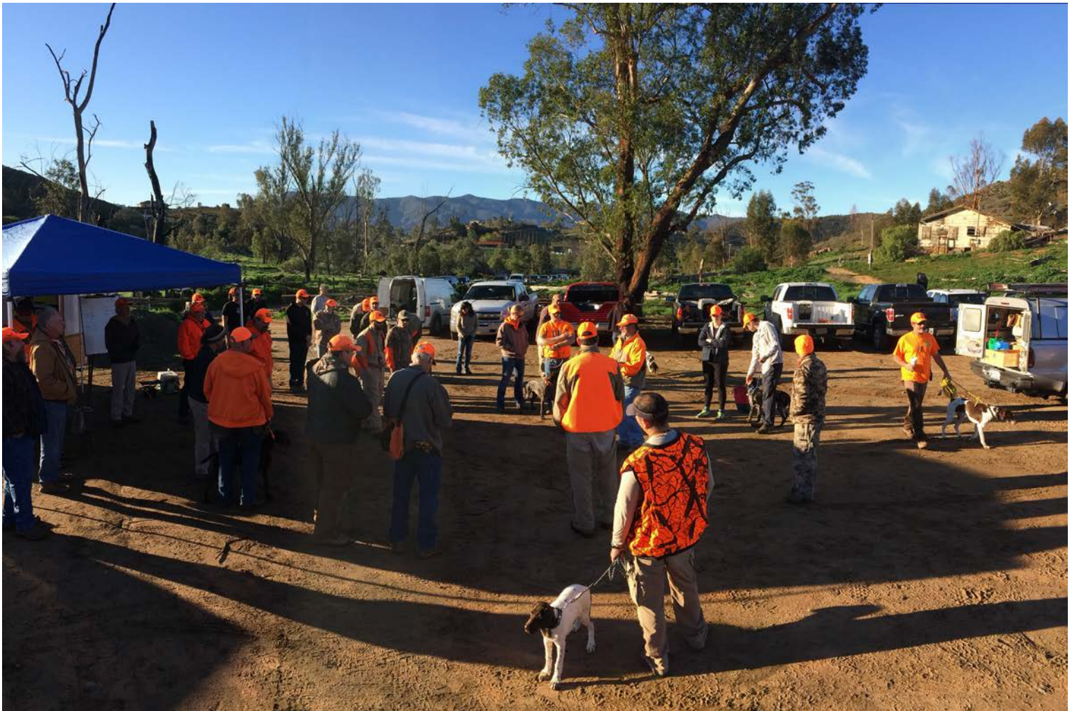
Above: Pre-training gathering & brief in the Honey Springs parking lot.